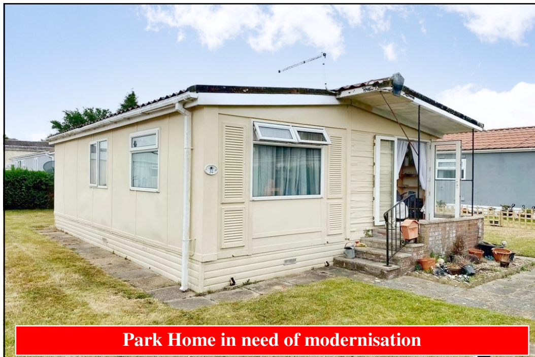
Park Home in need of modernisation

32 Gladelands Park, Ringwood Road, Ferndown, Dorset. BH22 9BW