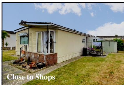
Close to Shops